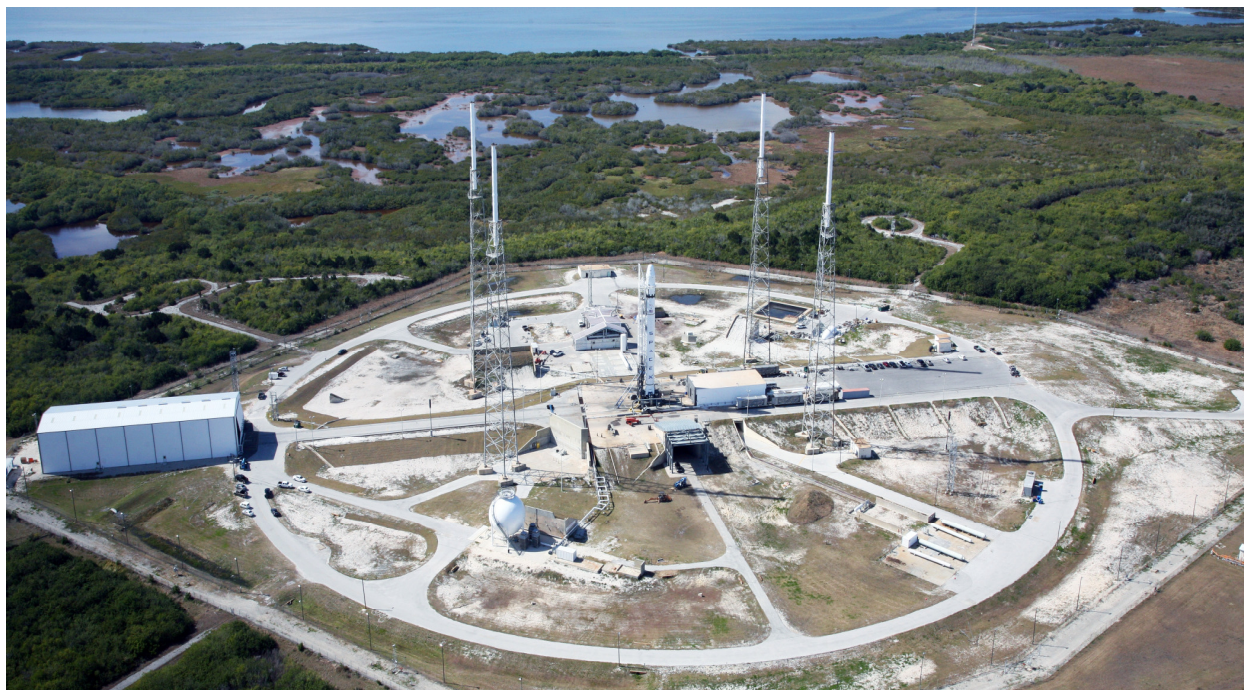
View looking west, showing SpaceX's Space Launch Complex 40 launch site, Cape Canaveral Air Force Station, with the Falcon 9 Flight 1 vehicle on the launch pad at the center.

The Falcon 9 launch site at Space Launch Complex 40 (SLC-40), on Cape Canaveral Air Force Station (CCAFS), is located on the Atlantic coast of Florida, approximately 5.5 km (3.5 miles) southeast of NASA's space shuttle launch site.